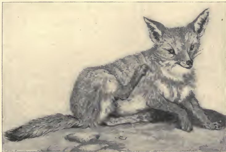
FIG. XLVII. VULPES MACROTIS . BIG-EARED KIT FOX.